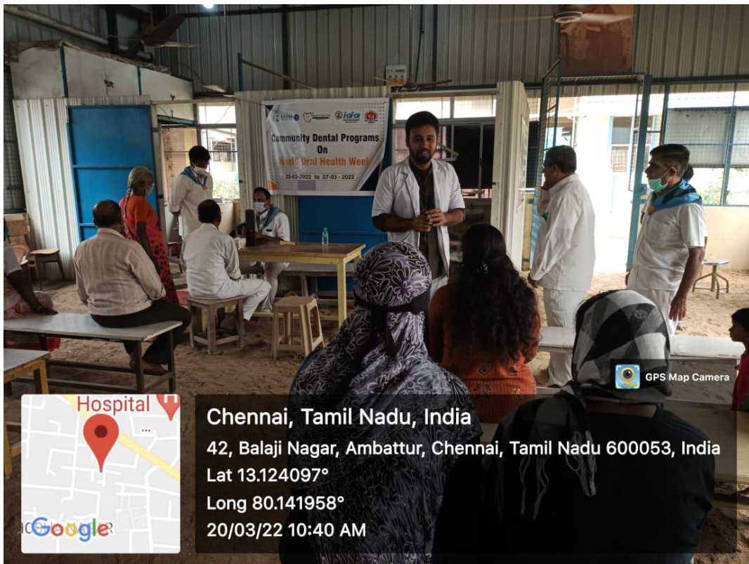
Dental camp conducted at Ambattur