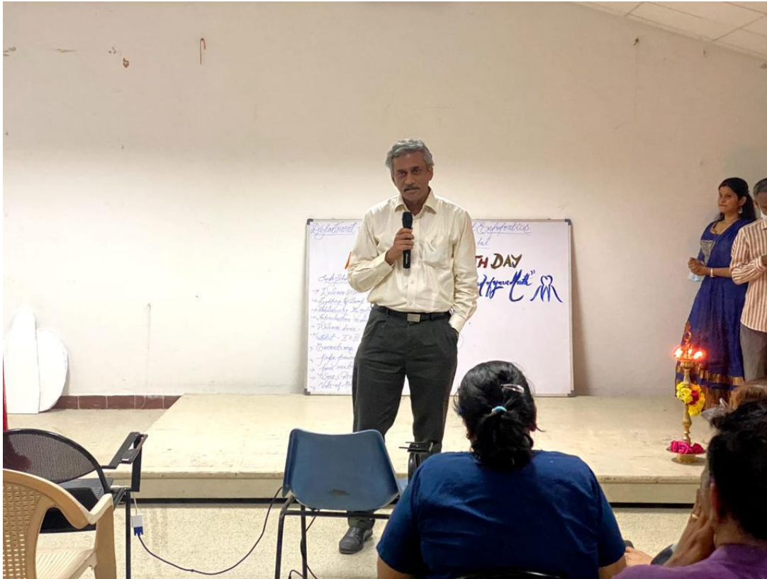
Awareness program and competition organized at our college by the Dept of Conservative Dentistry and Endodontics